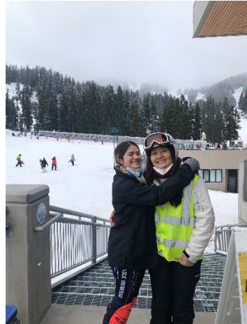
Volunteering for the high school ski races, Oregon Interscholastic Ski Racing Association (OISRA)