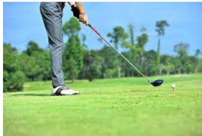
Donating time and money to the St Vincent de Paul church charity golf tournament.