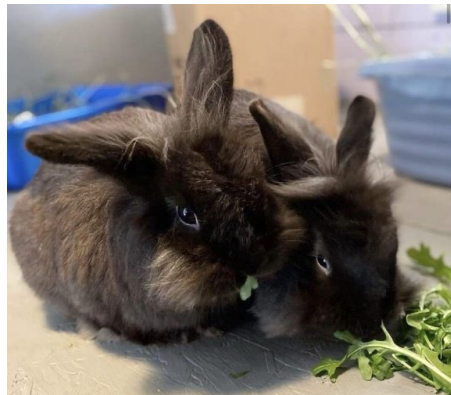
I am so happy to volunteer and foster for the only bunny rescue in Central Oregon, which saves hundreds of unwanted or stray bunnies each year.