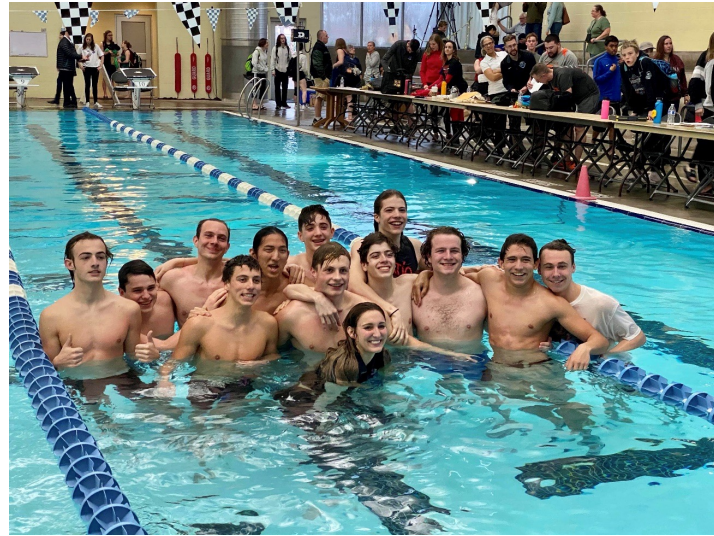
Volunteering as the USA Swimming Stroke and Turn Judge for the high school Districts Championship swim meet for the Oregon School Activities Association (OSAA).