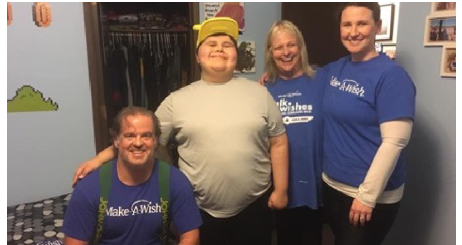
Wish reveal – this young man wanted a gaming bedroom makeover. This picture was taken after the room was painted and equipment set up...he was NOT disappointed! Can you tell?

For children diagnosed with critical illnesses, a wish come true can be a crucial turning point in their lives. A wish can be that spark that helps these children believe that anything is possible and gives them the strength to fight harder against their illnesses. This impact is why Make-A-Wish employees, board, and volunteers are driven to make every one of these wishes come true. Many of our employees’ support Make-A-Wish Oregon and we also employ a “wish granter” who volunteers to provide initial wish visits for children, ongoing updates for families, as well as wish granting parties and send-offs.