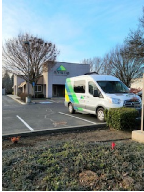
Donating time and money to the Marion Polk food share to help end hunger in Oregon.